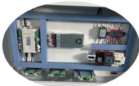
Control cabinet with RD laserword