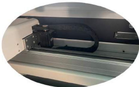
Stepper motor and famous linear guide