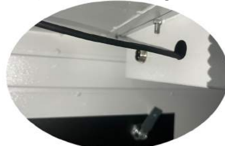
Rotary device connect port and open cover protection