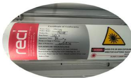
RECI brand wiht best in China