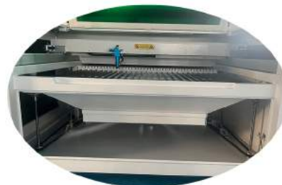
Up and down working table